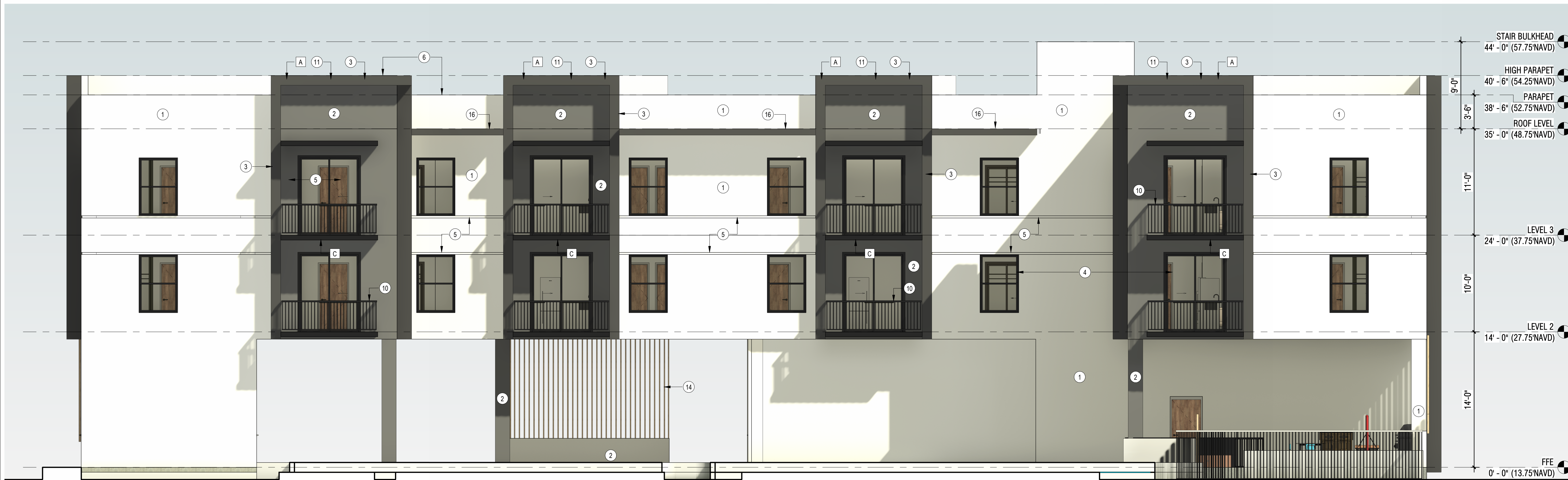
1 SOUTH ELEVATION (REAR) SCALE: 3/16" = 1'-0"