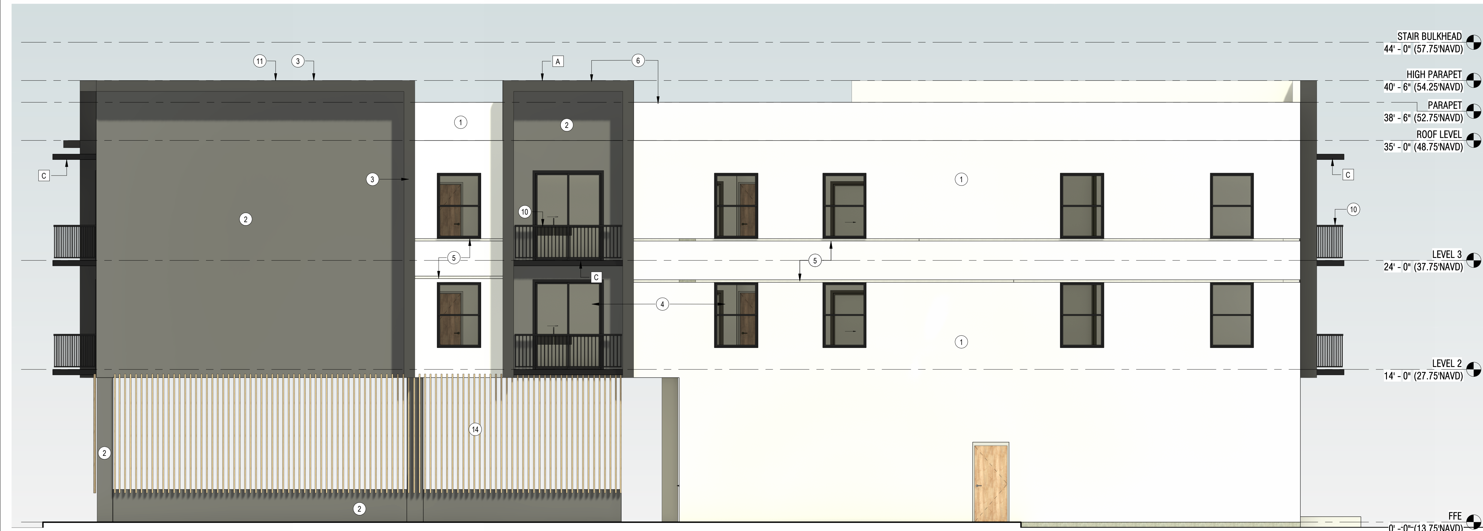
2 EAST ELEVATION (SIDE) SCALE: 3/16" = 1'-0"